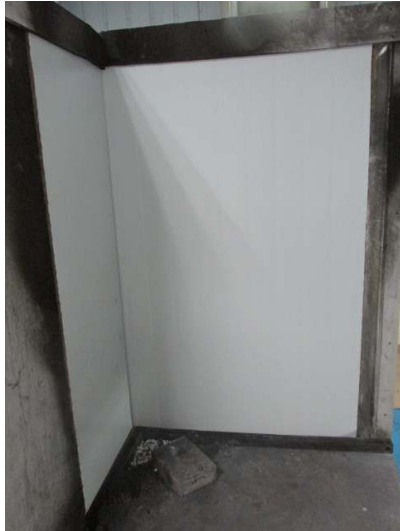
Before test (for EN 13823)