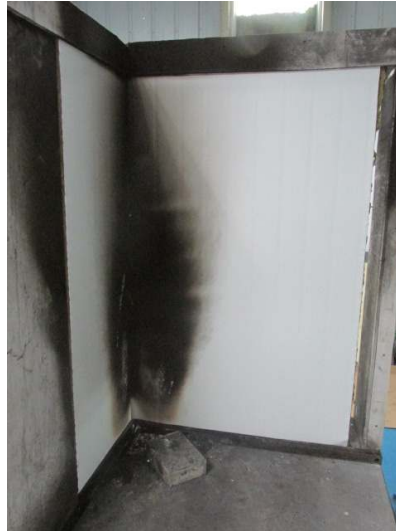
After test (for EN 13823)